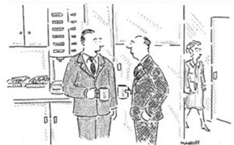
"Nope, no New Year's resolutions for me this year— I'm still working on a backlog dating from '87."

One evening a grandson was talking to his grandmother about current events. The grandson asked his grandmother what she thought about the shootings at schools, the computer age, and just things in general. The Grandmother replied, "Well, let me think a minute, I was born before: television, penicillin, polio shots, frozen foods, Xerox, contact lenses, Frisbees. There were no: credit cards, laser beams or ball-point pens. Man had not yet invented: pantyhose, air conditioners,