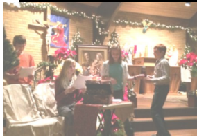
67 energetic students put on the Christmas play